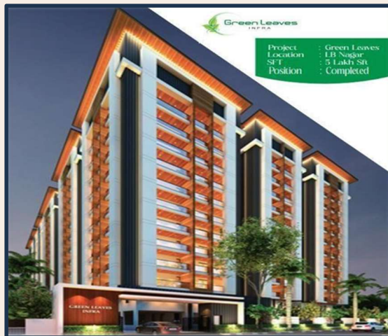
Green Leaves INFRA