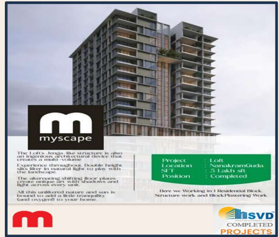
My Scape Properties Private Limited