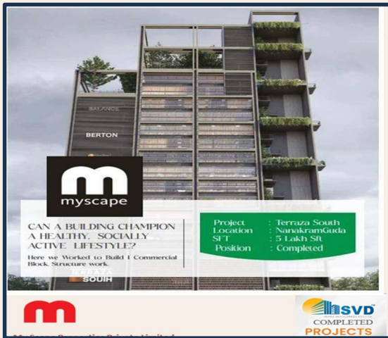
MY Scape Building: Terraaza South Tower